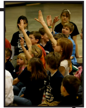
"Pick me, pick me!"