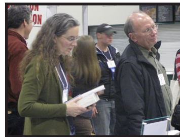
Perusing some of the curriculum for sale