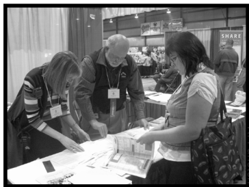
At the AHEA Booth