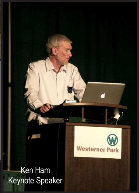
Ken Ham Keynote Speaker