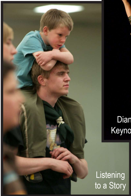
Listening to a Story