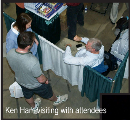
Ken Ham visiting with attendees